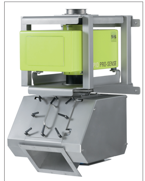
Reject unit with swivel hopper for special materials (Image contains options)