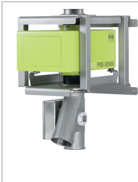
Round reject unit for powder