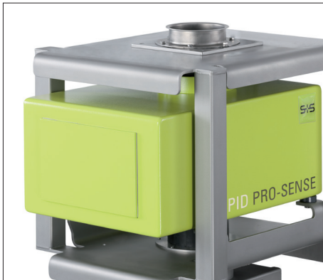
Detection unit with innovative HRF technology

The detection unit with innovative HRF technology (High Resolution Frequency) was developed especially to ensure an optimal scanning sensitivity for all metals. The detection signal is transmitted with a special frequency and evaluated. In addition to ferrous and non-ferrous metals, even smallest particles of non-magnetic stainless steel can now be detected and separated even more efficiently.