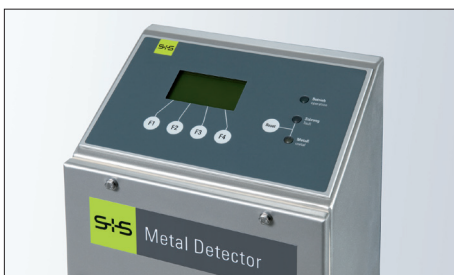
Electronic Control Unit GENIUS+