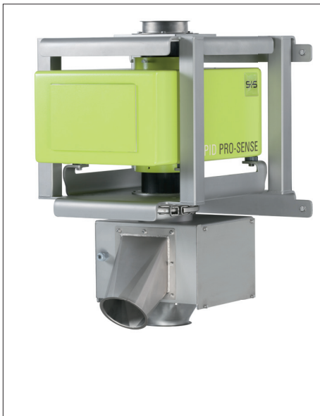
Standard reject unit "Quick-Flap"